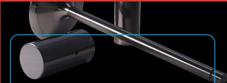
DIE GUIDE FOR BUSINESS CARD SLITS